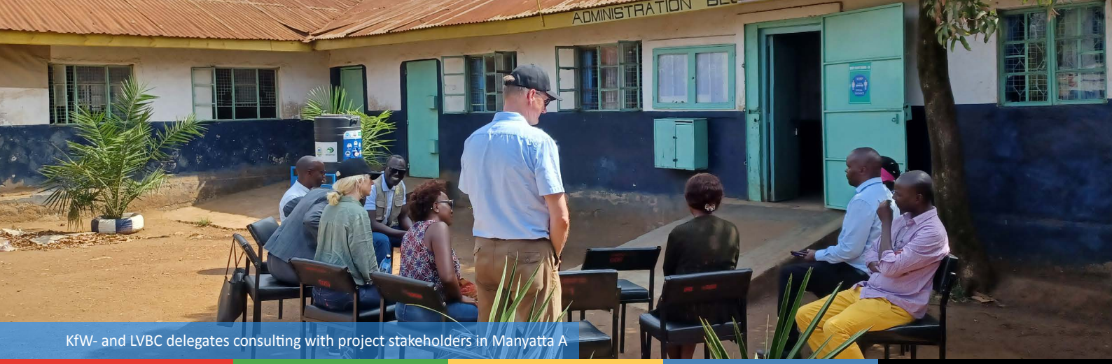
KfW- and LVBC delegates consulting with project stakeholders in Manyatta A